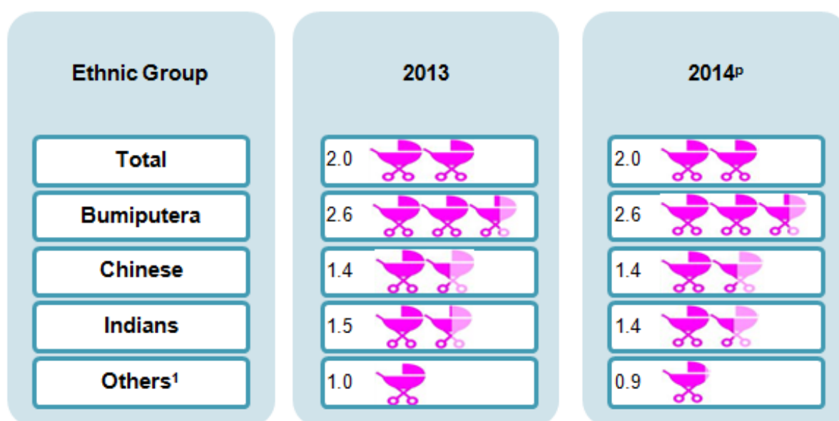
Chart 1: Total fertility rate by ethnic groups, Malaysia, 2013 and 2014 P

The analysis showed that the total fertility rate was below the replacement level; unchanged at 2.0 per woman aged 15–49 from 2013 to 2014. The fertility rates declined for Indians and Others, while Chinese and Bumiputera were unchanged at 1.4 and 2.6 in the same period. In 2014, the fertility rate for Bumiputera was 2.6 per woman aged 15–49 years, which was above the replacement level. This implies that an average of 2.6 babies would be born to every Bumiputera woman in her reproductive age (15–49 years). By contrast, the rates for both Chinese and Indians were below the replacement level at 1.4 respectively, and Others at 0.9 per woman aged 15–49 years (Chart 1).