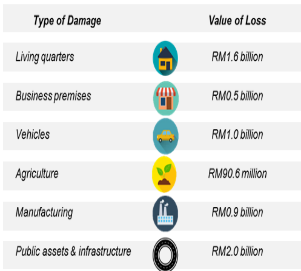
Exhibit 1: Value of Flood Losses by Type of Damage

Overall losses due to the floods recorded RM6.1 billion which equivalent 0.40 per cent as against nominal Gross Domestic Product. Living quarters losses were RM1.6 billion, business premises RM0.5 billion, vehicles RM1.0 billion, agriculture RM90.6 million, manufacturing RM0.9 billion and public assets & infrastructure RM2.0 billion as shown in Exhibit 1.