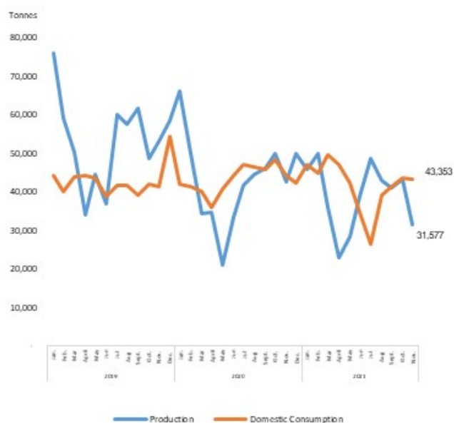
Chart 1: Monthly production and domestic consumption of natural rubber 2019 - November 2021 (tonnes)