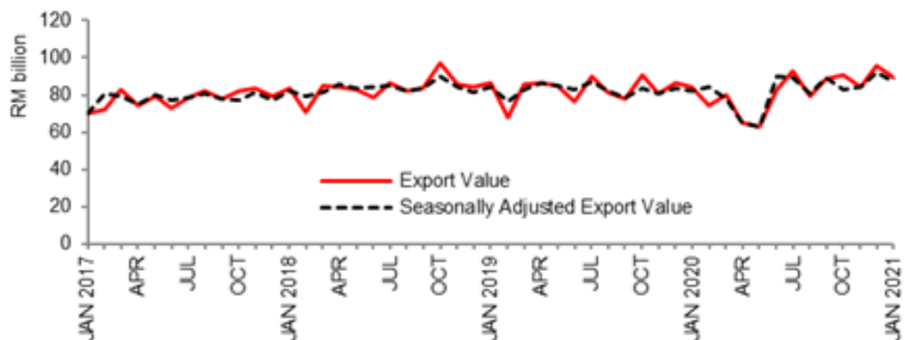
Chart 2: Export Value and Seasonally Adjusted Export Value, RM billion