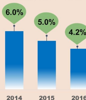
Annual 2014 - 2016